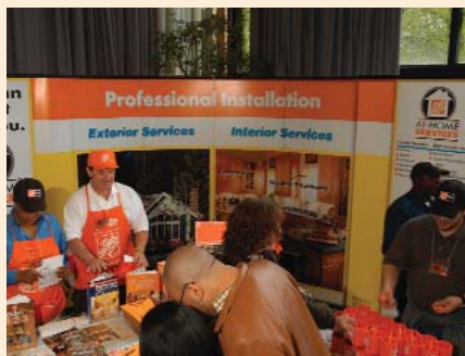
The Home Depot booth at the 3rd Annual Bungalow Expo.